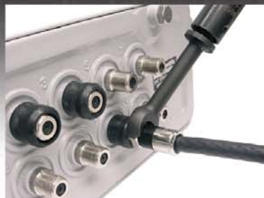
Visually inspect to ensure connector is fully compressed and tighten to recommended torque