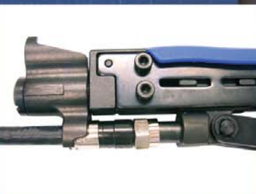
Properly seated connector ready for compression