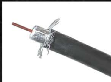
Fold back braid