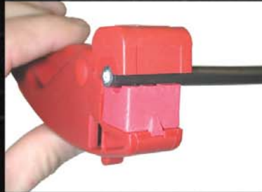
Using a fixed blade prep tool in good condition, prepare cable to 1/4" x 1/4" dimensions