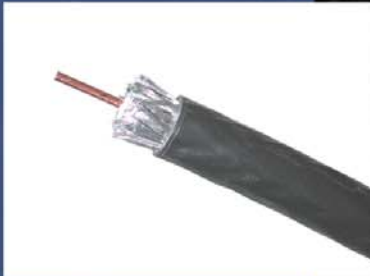
Ensure there is no dielectric, braid or foil wrapped around center conductor