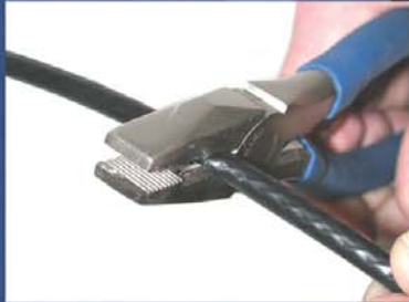
Cut Cable Squarely