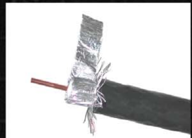
If tri-shield or quad, remove outer layer of foil