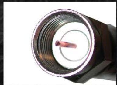
Dielectric is flush within the post